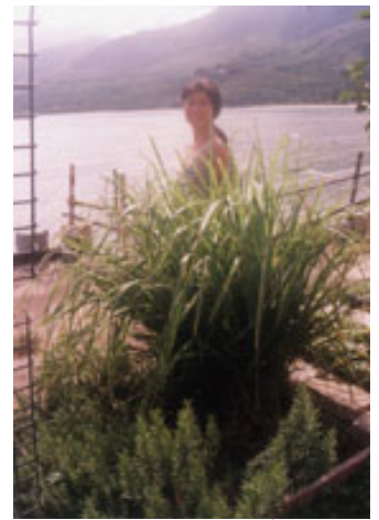
This large clump of lemon grass grew from three small stems

"The world's most dangerous animal is the mosquito," according to a BBC World Service health program: malaria now infects approximately 110 million